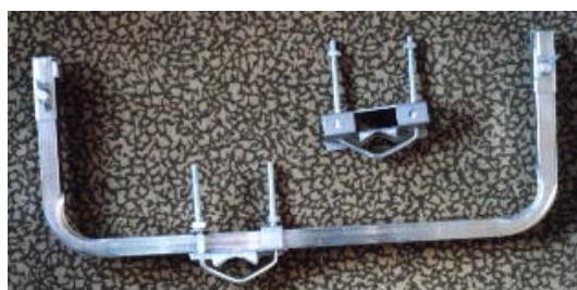
Fig.4, cradle boom + slide clamp, & a single slide clamp

Two types of slide clamp are shown, the one on its own being by Maxview, from B+Q.