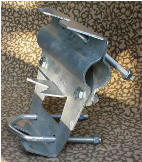
Fig.5, Shelly HD clamp, 2" to 1_"