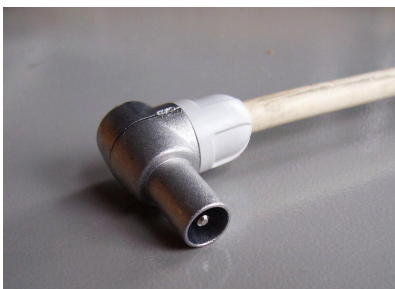
Televes co-ax plug with screw + clamp fitting