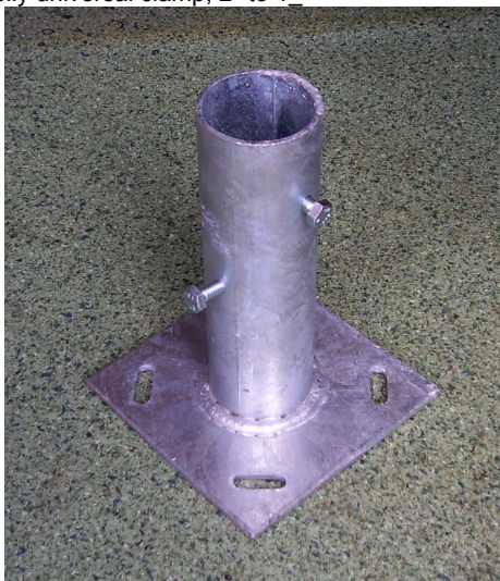
Patio Bracket, nom. 2 1/8" int.dia.