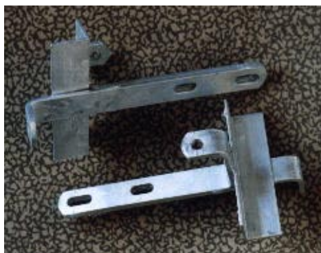
Fig.3, double brackets (requires 2 Lashing Kits+2" V-bolts)