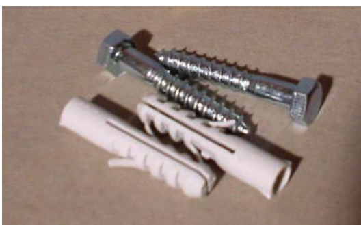
Fig.7, Mungo fixings

Finally, don't forget the masonry fixings: