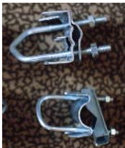
Fig.2, Mast clamps 1" 1"