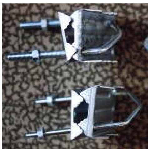
Fig.1, FM Clamps HD