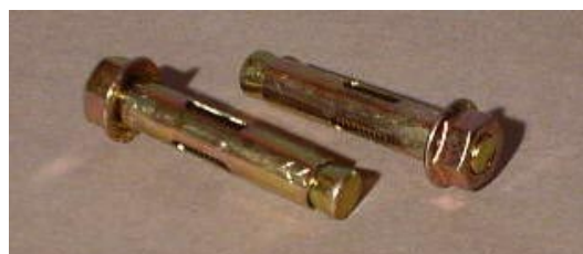
Fig.8, Sleeved anchor bolts