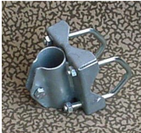
Fig.6, Shelly universal clamp, 2" to 1_"